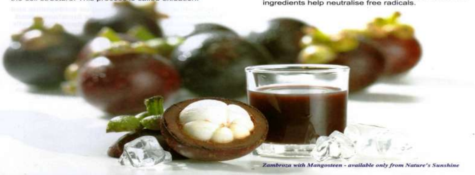
Zambroza with Mangosteen - available only from Nature's Sunshine

As certified by Brunswick Laboratories, Zambroza is the world's premier antioxidant drink, combining a variety of natural ingredients that synergistically provide health benefits many times greater than the individual benefits of each ingredient. These powerful ingredients help neutralise free radicals.